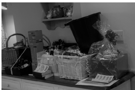
The raffle prizes