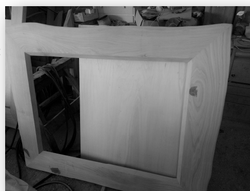
The frame for the storyboard